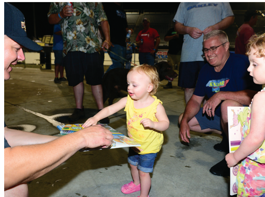
Friday night's Impact Racer Appreciation Party entertained both young and old alike with food, music, a magic show, face painting and prizes.

out, Friday's race was completed early, allowing Saturday's Wiseco-sponsored race to begin. With darkening skies later in eliminations, officials worked diligent-