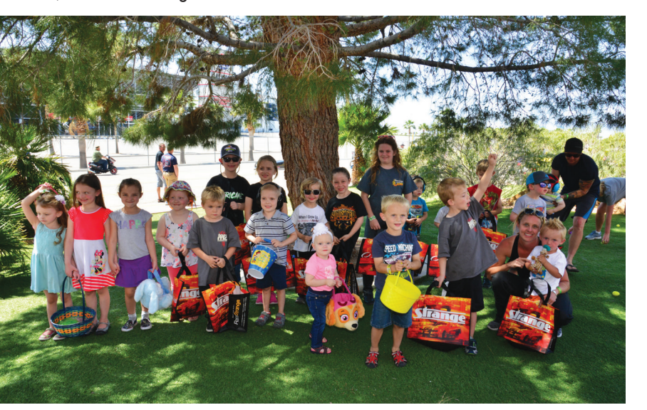
This year with Easter falling on Sunday, all the kids were invited to a typical Easter Egg Hunt prior to Saturday's eliminations. Two golden eggs were hidden with cash inside. Needless to say, the kids were thrilled and so were the parents.

In addition, there was also the Last Man Standing prize where the names of only 200 of the Million Dollar entrants were placed in a bucket. For $50 anyone can have the chance to pull a name out of the bucket. The person holding the name of the racer who went the furthest earns themselves $10,000.