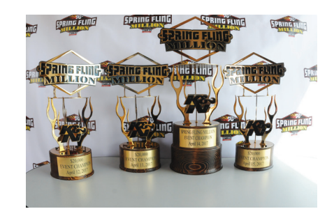
Besides the money, each champ walks away with gorgeously designed and heavy Spring Fling trophies.

up to $500,000, and at 550 it would pay $1,000,000 to the winner, a great match for the city of Las Vegas where dreams do come true. In fact, the words