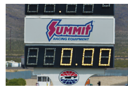
Bracket racing is really simple: Cut a .000 reaction time and run dead-on your dial-in. At a race such as this, there are more guys and gals knowing how to do just that or at the very least, come extremely close.

"dreams come true" made its way into the winner's circle interviews of each of the Spring Fling winners.