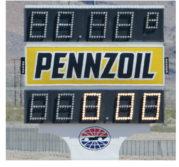
Left: How good are these guys and gals? More perfect reaction times popped up on the scoreboards during time trials than maybe ever seen. The same numbers seemed to happen all throughout eliminations.