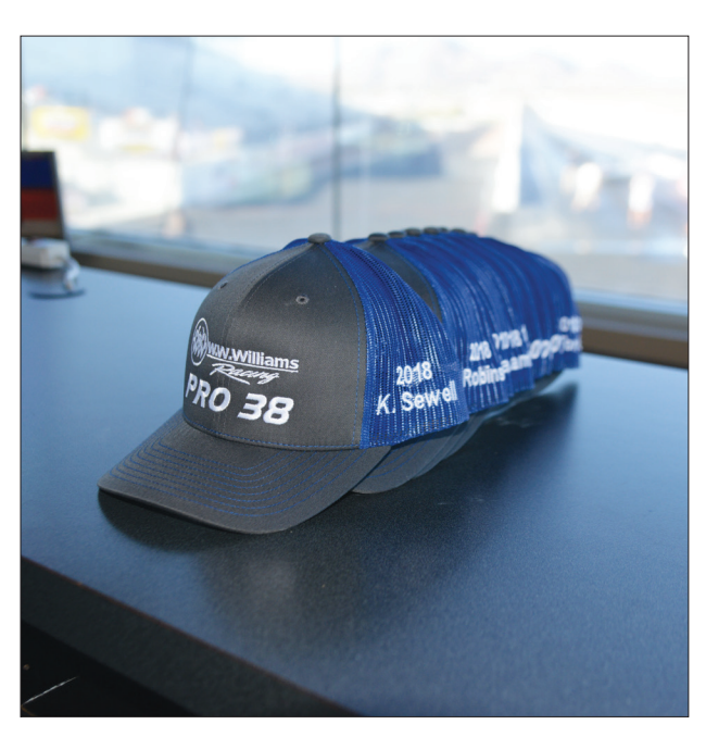
Left: Each of the Pro 38 racers were given a special hat with their names embroidered on it. Little things like that are what makes this event so special.

On Friday morning prior to the Million, a special time trial session, Run For The $50K, was held. For a $50 entry fee, with a dial on your car, a perfect