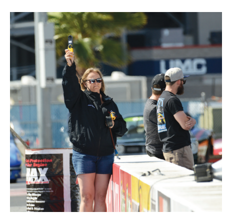
If there is one seemingly constant in Vegas, it's the wind. Breezy conditions... no make that very windy... might have played havoc with dial-ins, but you wouldn't know that by the amount of dead-on the dial runs.