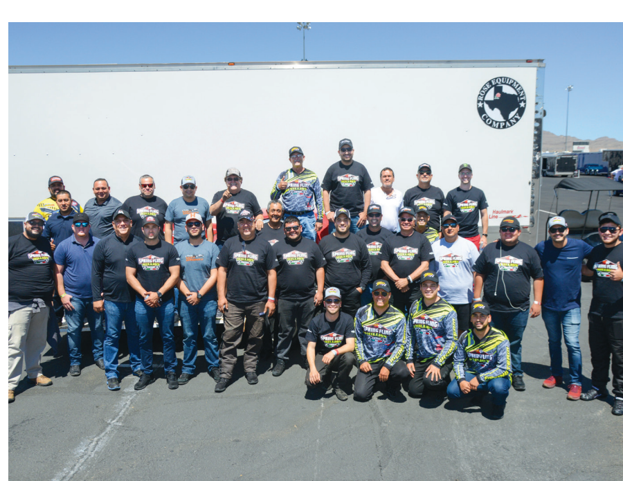
In addition to entries from 38 states, Canada and Puerto Rico, a large contingent of racers, family and crew from Mexico show up every year to enjoy the celebrations.