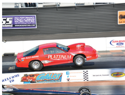
Hundreds of racers flocked to the new facility, most in part who have never been here before but heard just how nice the facility is, and they were not disappointed.

The scoreboards are LCD screen models on which any number of videos can be played. The Spring Fling at Galot event was held on the same weekend as the Lucas Oil NHRA Southern Nationals. During a brief rain delay at Galot on Saturday, race officials up-