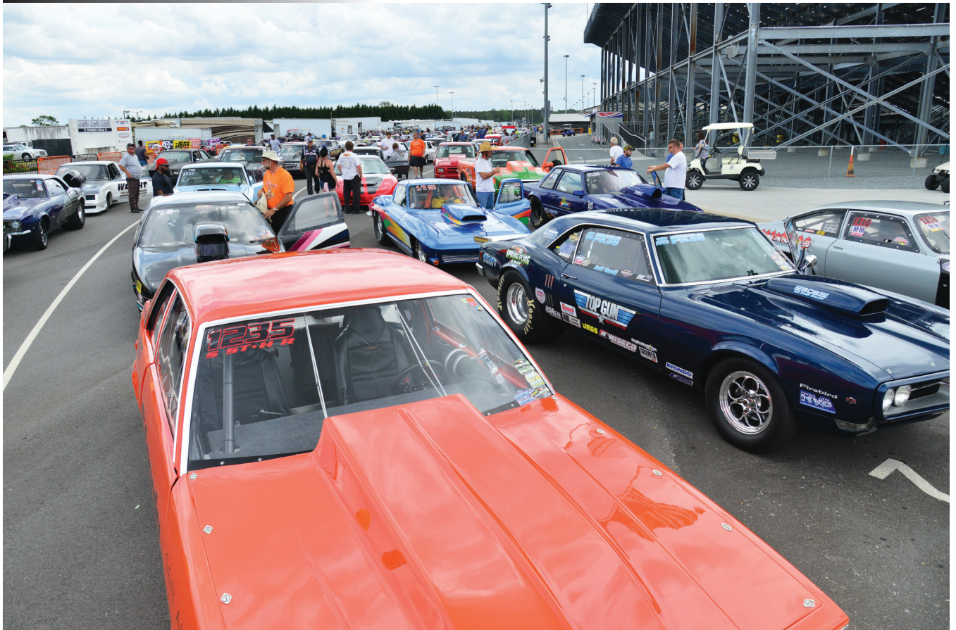
The concept of running door cars separate from dragsters until the ladder round of 16-cars or less has made a big difference with the door car contingent. More and more of them are showing up to take part in the festivities.