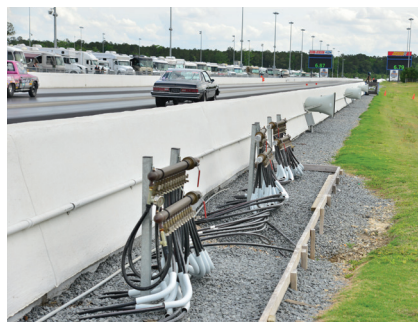
In addition to a small drainage ditch at the edge of the track for easier track drying, plumbing lines underground allow for track surface cooling during those hot days of summer.

loaded the NHRA All Access broadcast to the scoreboards. Impressive is all we can say.