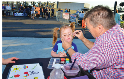
The Spring Fling races are truly a fun event for the whole family.